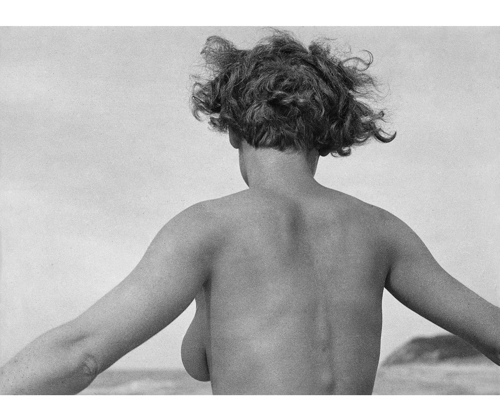
We all love conflagrations. When the sky changes color, it is a dead man's passing.