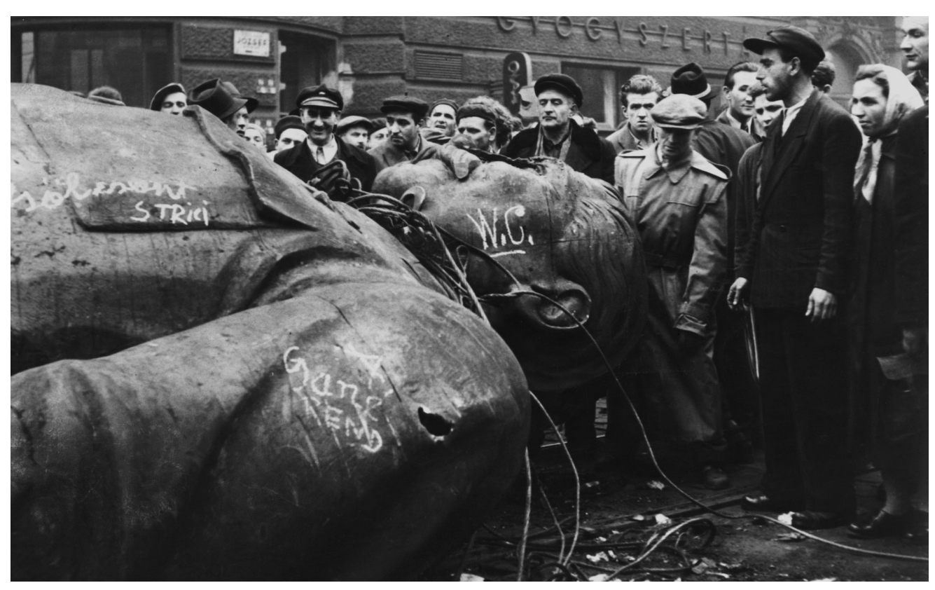
Hungarians stand over the toppled statue of Joseph Stalin on October 23, 1956