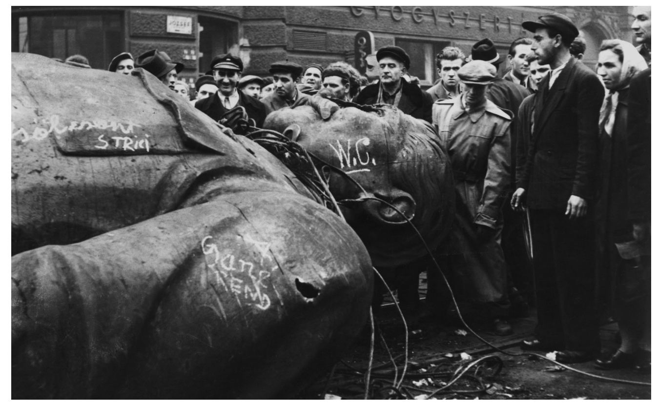
Hungarians stand over the toppled statue of Joseph Stalin on October 23, 1956

1997: Alexander Brener paints a green dollar sign on Kazimir Malevich's Suprematisme , stating in court that "the cross is a symbol of suffering, the dollar sign a symbol of