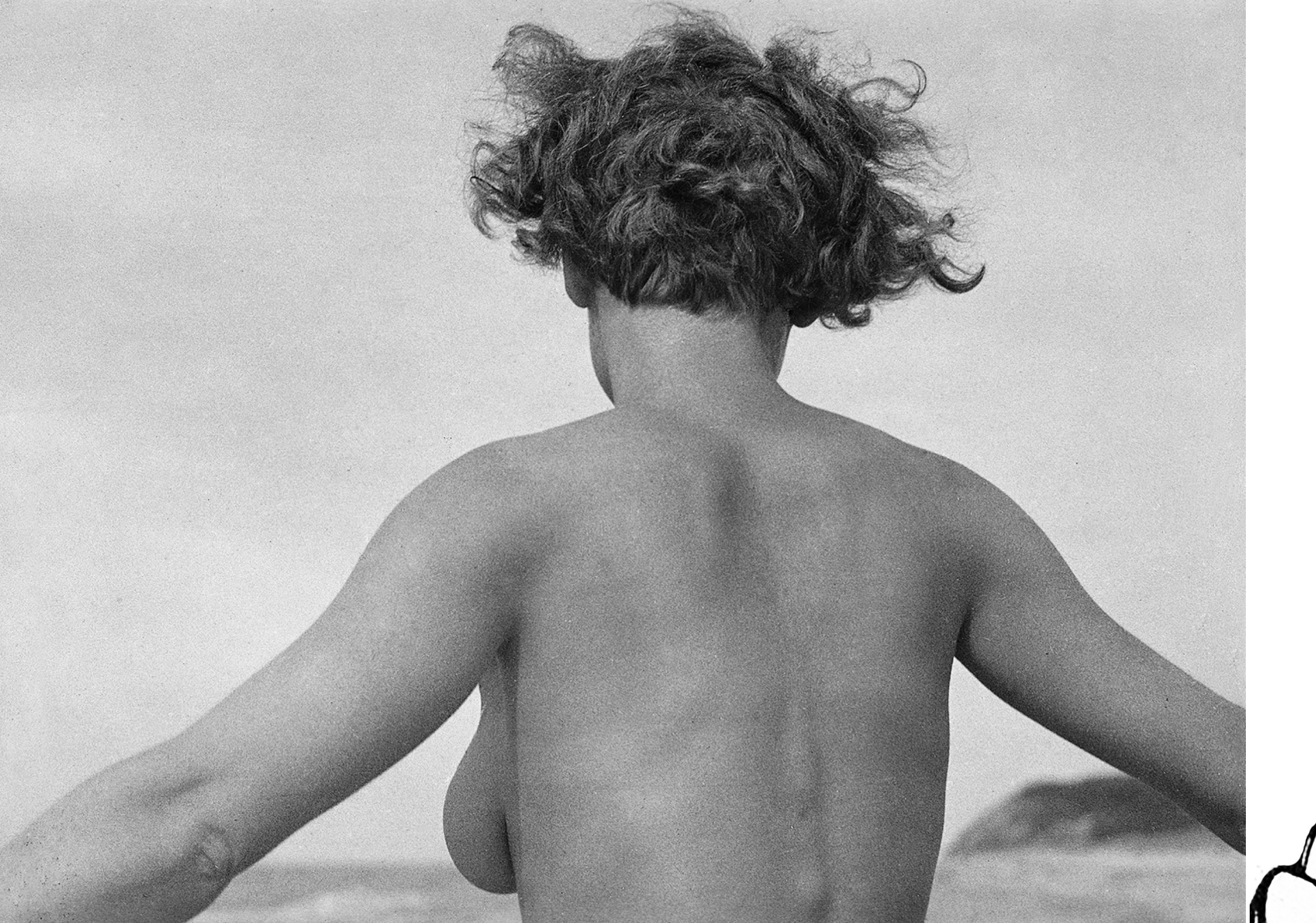
We all love conflagrations. When the sky changes color, it is a dead man's passing.